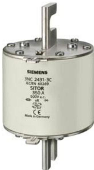
Similar to image

SITOR FUSE-LINK FOR SEMICONDUCTOR PROTECTION 200A GR 500V SIZE 3 CONNECTION CONTACT INDICATOR 110MM