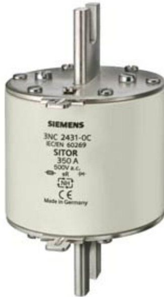
Similar to image

SITOR FUSE-LINK FOR SEMICONDUCTOR PROTECTION 250A GR 500V SIZE 3 CONNECTION CONTACT INDICATOR 110MM