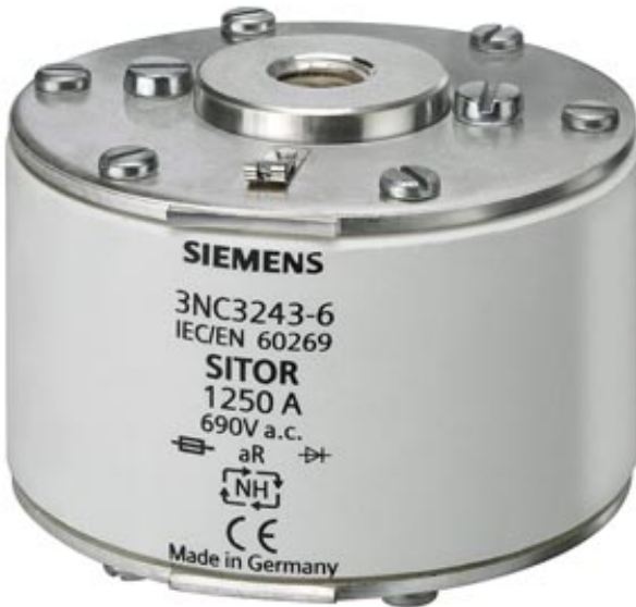
Similar to image

SITOR FUSE-LINK FOR SEMICONDUCTOR PROTECTION 315A AR 1250V SIZE 3 CONNECTION INT. THREAD M12