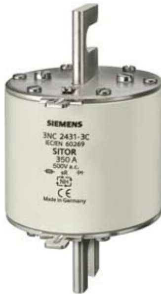
Similar to image

SITOR FUSE-LINK FOR SEMICONDUCTOR PROTECTION 1000A AR 600V SIZE 3 CONNECTION CONTACT INDICATOR 110MM