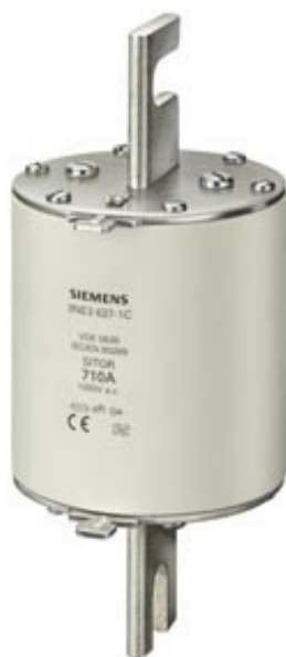
SITOR FUSE-LINK FOR SEMICONDUCTOR PROTECTION 710A AR 1000V SIZE 3 CONNECTION CONTACT INDICATOR 140MM