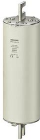
SITOR FUSE-LINK FOR SEMICONDUCTOR PROTECTION 500A AR 2500V SIZE 3 CONNECTION CONTACT INDICATOR 260MM