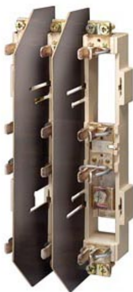
LV HRC BUS MOUNTING FUSE BASE 660V, 2X3-POLE, (TANDEM) 160A