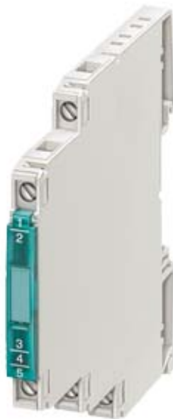
INTERFACE CONVERTER AC/DC 24 V, 2 WAY SEPARATION ON: 4 TO 20 MA OFF: 4 TO 20 MA CAGE CLAMP