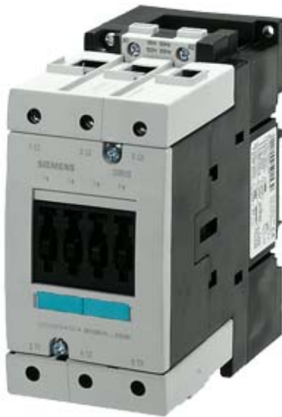
CONTACTOR, AC-3 30 KW/400 V, AC 110 V, 50 HZ, 3-POLE, SIZE S3, SCREW CONNECTION