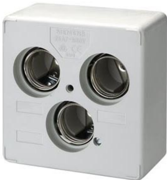
DIAZED-BASE DIII 63A 3POLE AC690V DC500V WITH COVER AND N TERMINAL SCREW TYPE