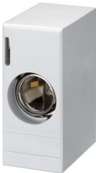
NEOZED FLUSH-MOUNTING FUSE BASE WITH MOULD.PLAST.CAP SIZE D03/100A, SINGLE-POLE SNAP-ON TYPE