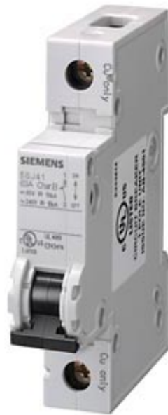
CIRCUIT BREAKER 240V 14KA, 1-POLE, B, 16A, D=70MM ACC. TO UL 489, SAME POLARITY