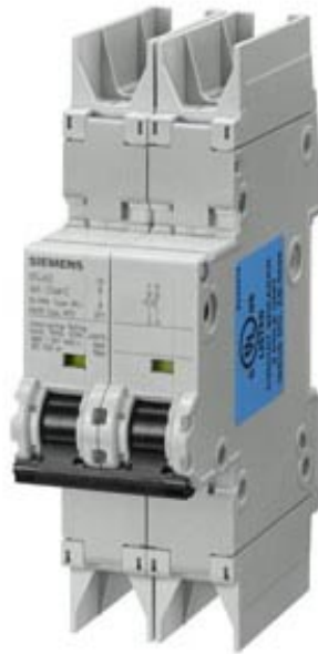
CIRCUIT BREAKER 10KA, 2POLE, C, 20A ACC. TO UL 489 - 480Y/277V