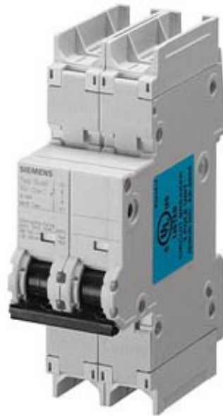
CIRCUIT BREAKER 240V 14KA, 2-POLE, D, 20A, D=70MM ACC. TO UL 489