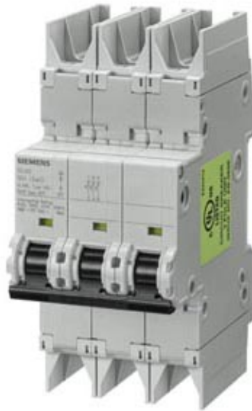
CIRCUIT BREAKER 10KA, 3POLE, C, 13A ACC. TO UL 489 - 480Y/277V