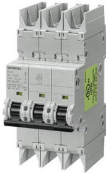
CIRCUIT BREAKER 10KA, 3POLE, C, 32A ACC. TO UL 489 - 480Y/277V