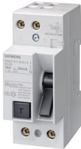
RES.CURRENT OP.CIRCUIT BREAKER TYPE A PSE/SSF 16A 1+N-POL IFN 30MA 24-125V 2M