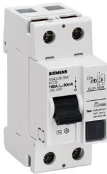
RES.CURRENT OP.CIRCUIT BREAKER TYPE AC WS 100A 2POLE IFN 30mA 230V 2MW