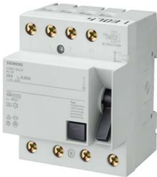
RES.CURRENT OP.CIRCUIT BREAKER TYPE A PSE/SSF 25A 3+N-POL IFN 30MA 400V 4MW