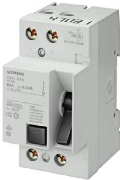
RES.CURRENT OP.CIRCUIT BREAKER TYPE A PSE/SSF 63A 1+N-POL IFN 300MA 230V 2,5M FOR SELECTIVE SWITCH OFF