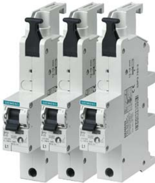
MAIN CONDUCTOR CIRCUIT-BREAKER (SHU), 1-POLE, E 25 A, 230/400 V (SET WITH L1,L2,L3)