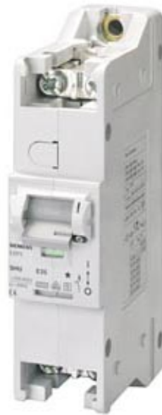
M.C.B. F. POWER SUPPLY COMPANY SELECTIVE 1POLE 32A