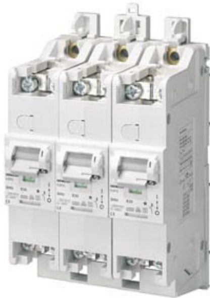
MAIN CIRCUIT BREAKER (SHU) SELECTIVE, 3X1POLE, 100A MOUNTED ON SHU-ADAPTER 5ST1324 AND 3 ATTRIBUTED PROTECTIVE COVER 5ST1323