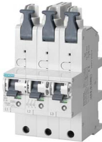
MAIN CONDUCTOR CIRCUIT-BREAKER (SHU),3X1-POLE,E 35 A,230/400 V FOR MOUNTING ONTO 40MM BUSBAR