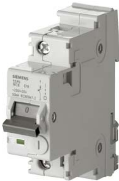
CIRCUIT BREAKER 230/400V 50KA ACC. IEC 947-2, T92 1-POLE, C, 20A