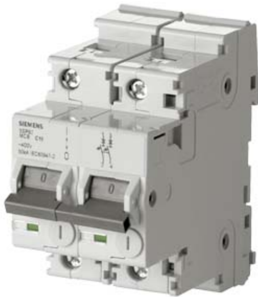
CIRCUIT BREAKER 400V 50KA ACC. IEC 947-2, T92 2-POLE, C, 20A