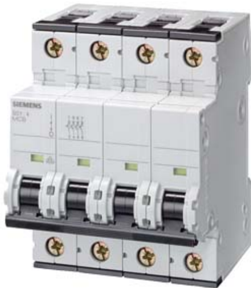
CIRCUIT BREAKER 400V 20KA, 4-POLE, 63A, D=70MM ONLY MAGNETIC TRIPPING