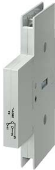
AUXIL. CONTACT SWITCH, 92MM 6A 2CO CONTACT