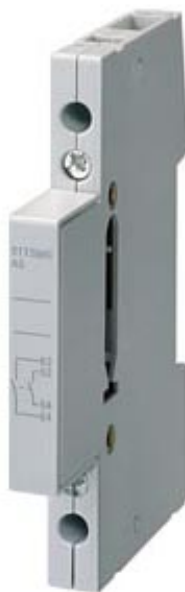
CONTROL SWITCH WITH 2 NO CONTACTS FOR 230 V AC FOR 5TT573,5TT574 AND 5TT575