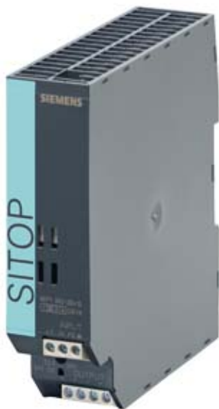
SITOP SMART 60 W STABILIZED POWER SUPPLY INPUT: 120/230 V AC OUTPUT: 24 V DC/2.5 A