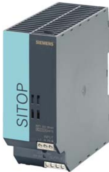
SITOP SMART 120 W STABILIZED POWER SUPPLY INPUT: 120/230 V AC OUTPUT: 24 V DC/5 A PFC VERSION